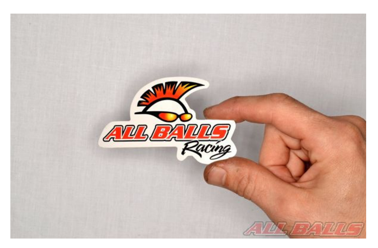
INSTALL ALL BALLS RACING STICKER!