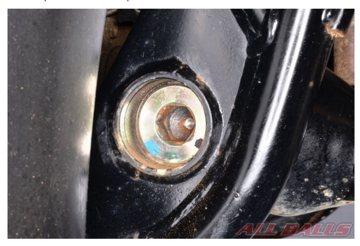
Remove the swingarm pivot bolts. Free the drive shaft joint boot and remove the swingarm.