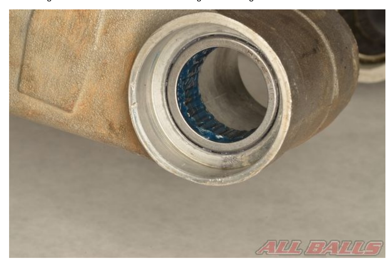
Make sure the bearings are properly greased.

Position the bearings at the proper depth inside the swingarm. In the case of our example, a 2010 Yamaha YZ450F, the outer bearings are required to flush with the outer edge of the bore, and the inner bearings should be 6.5 mm below the inner edge of the swingarm.