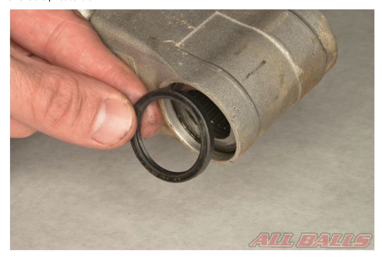
Remove the outer dust seals.