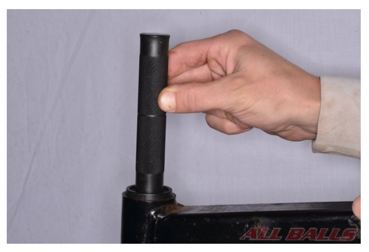
Drive in the bearing race with a suitable driver that only contacts the race on its outside diameter. Do not contact the angled section of the bearing race.