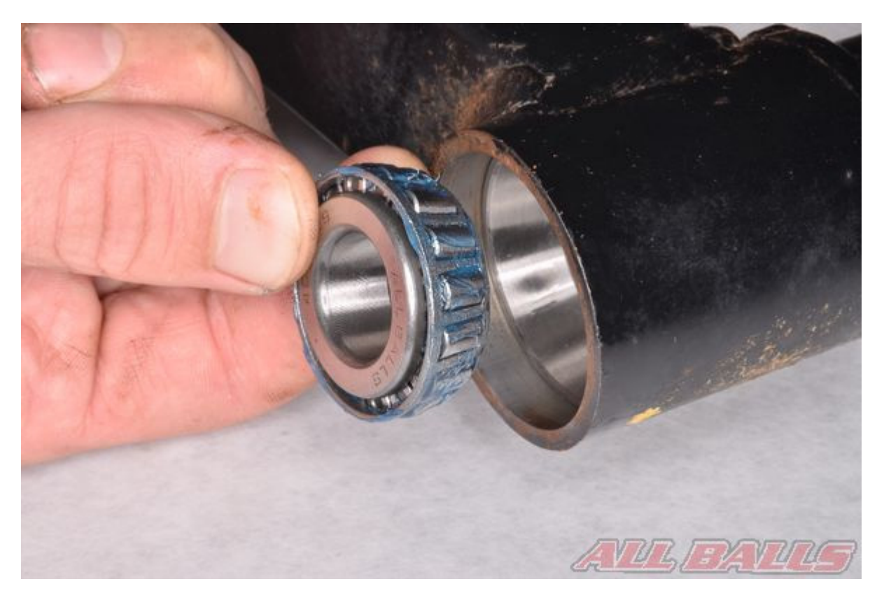
Install the swingarm bearings into the races.