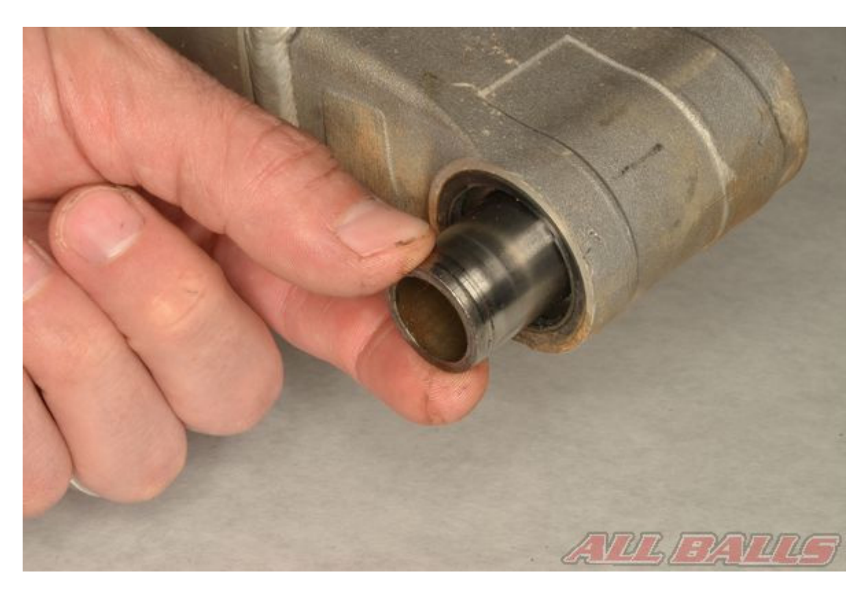
Remove the pivot collars.