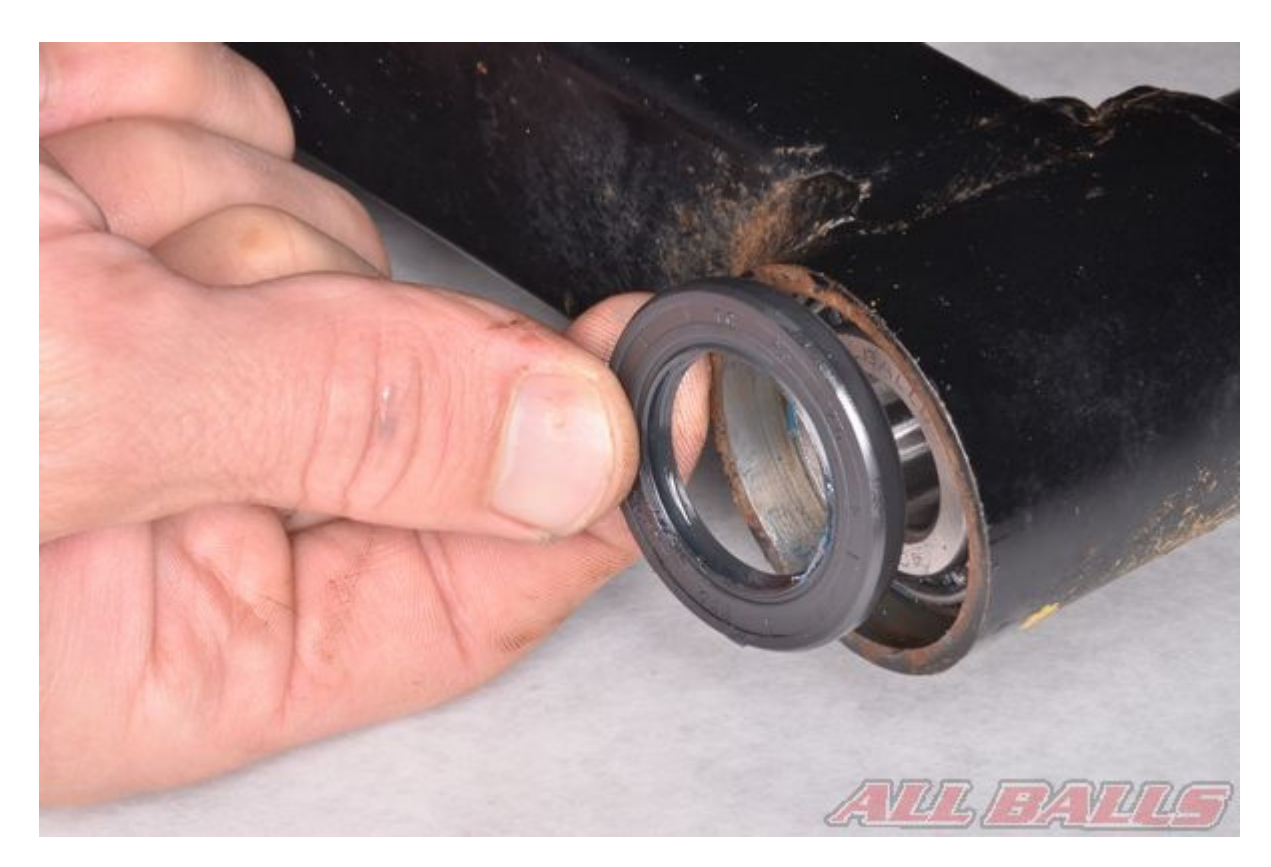
Install the dust seals into the swingarm.