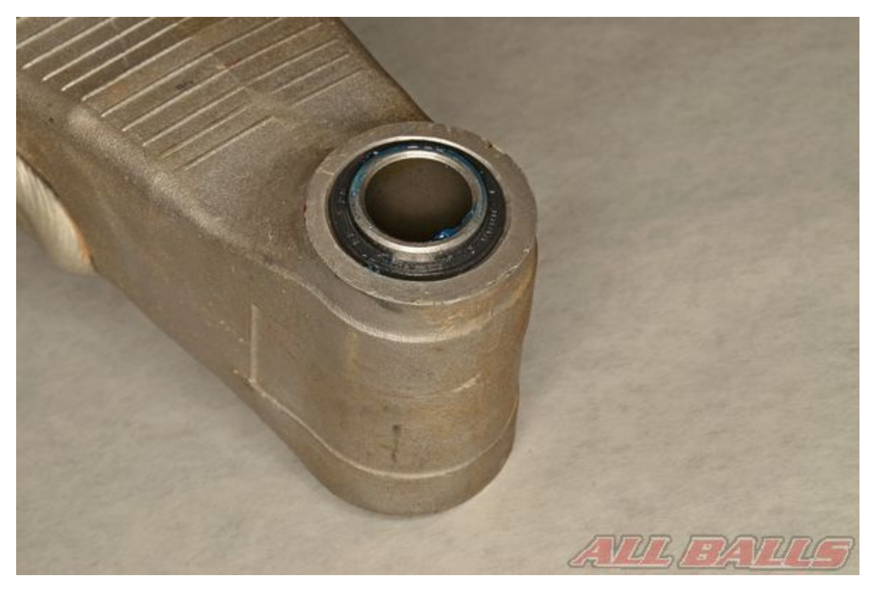
Position the seal as indicated in the service manual. The seals should be flush with the edge our 2010 Yamaha YZ450F.

Install the inner dust seals. Install the dust seals with the markings facing out. Often the dust seals can be gently pressed in by hand. If needed use a suitable driver with the same outside diameter as the seal to to press the seal into the bore.