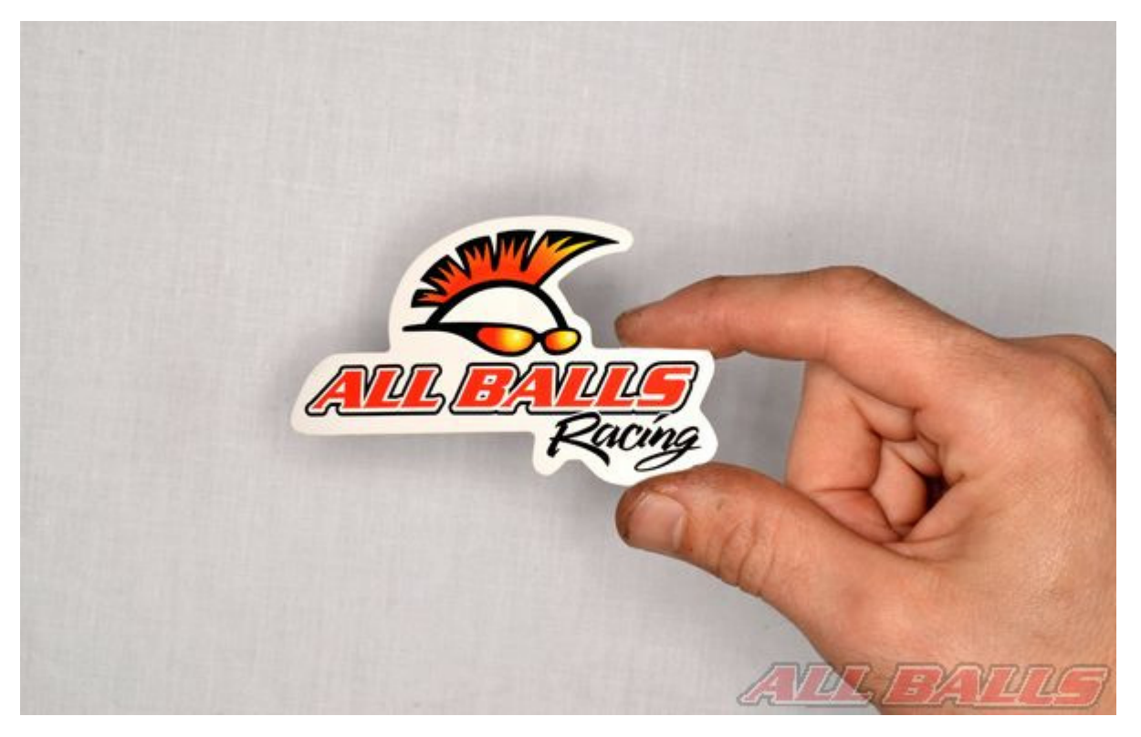
INSTALL ALL BALLS RACING STICKER!

To make your bearings last longer- avoid pressure washing around the bearing seals for extended periods of time. Pressure washers will push water right around seals causing premature rusting of the bearings.