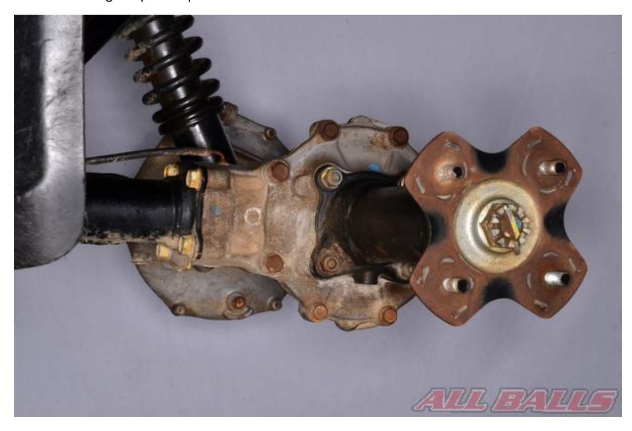
Support the back of the frame so the weight of the vehicle is not being supported by the swingarm.