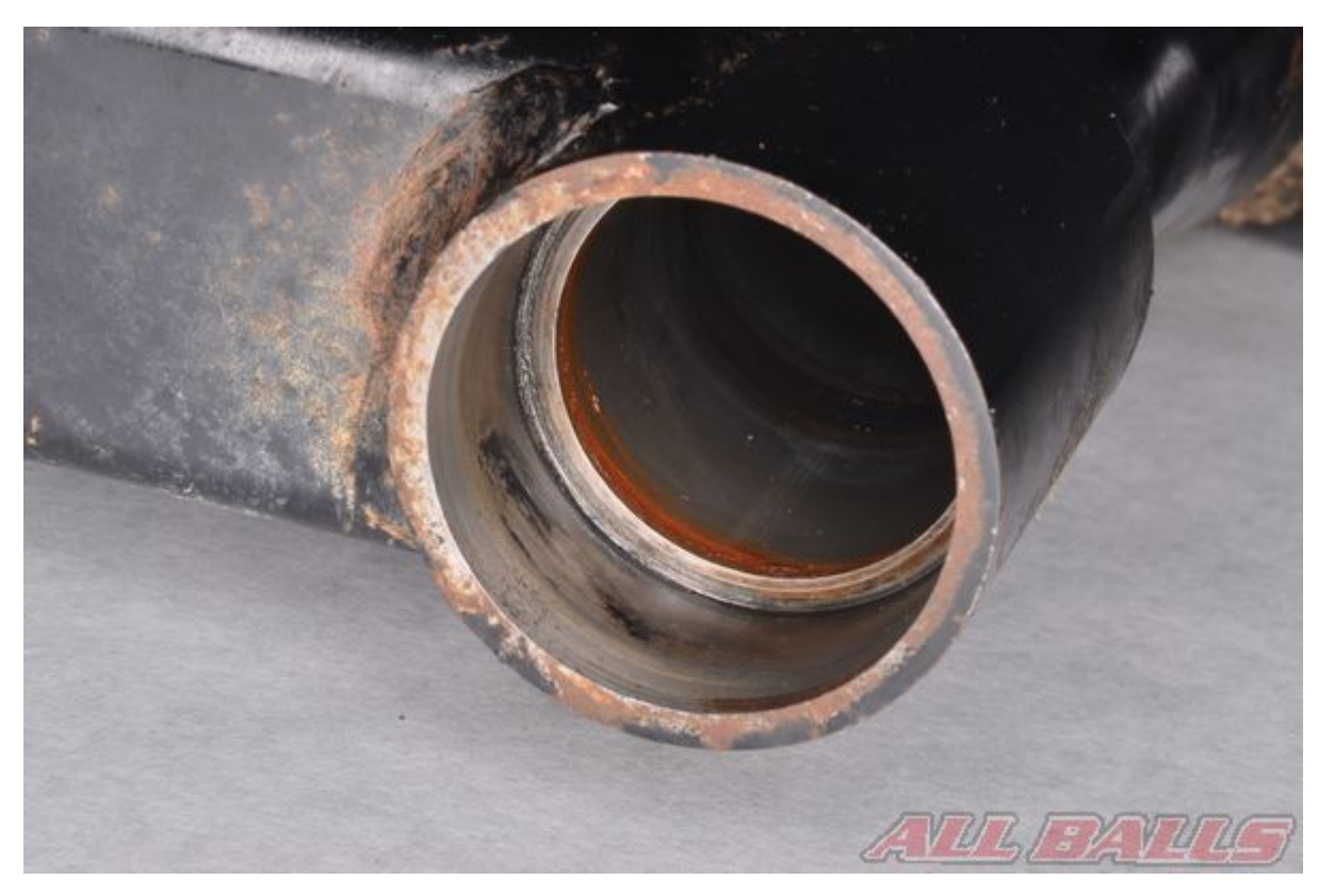
Inspect the bearing bores for wear and damage. Make sure the bores are free of damage or burrs that may cause the new bearings to hang during installation.