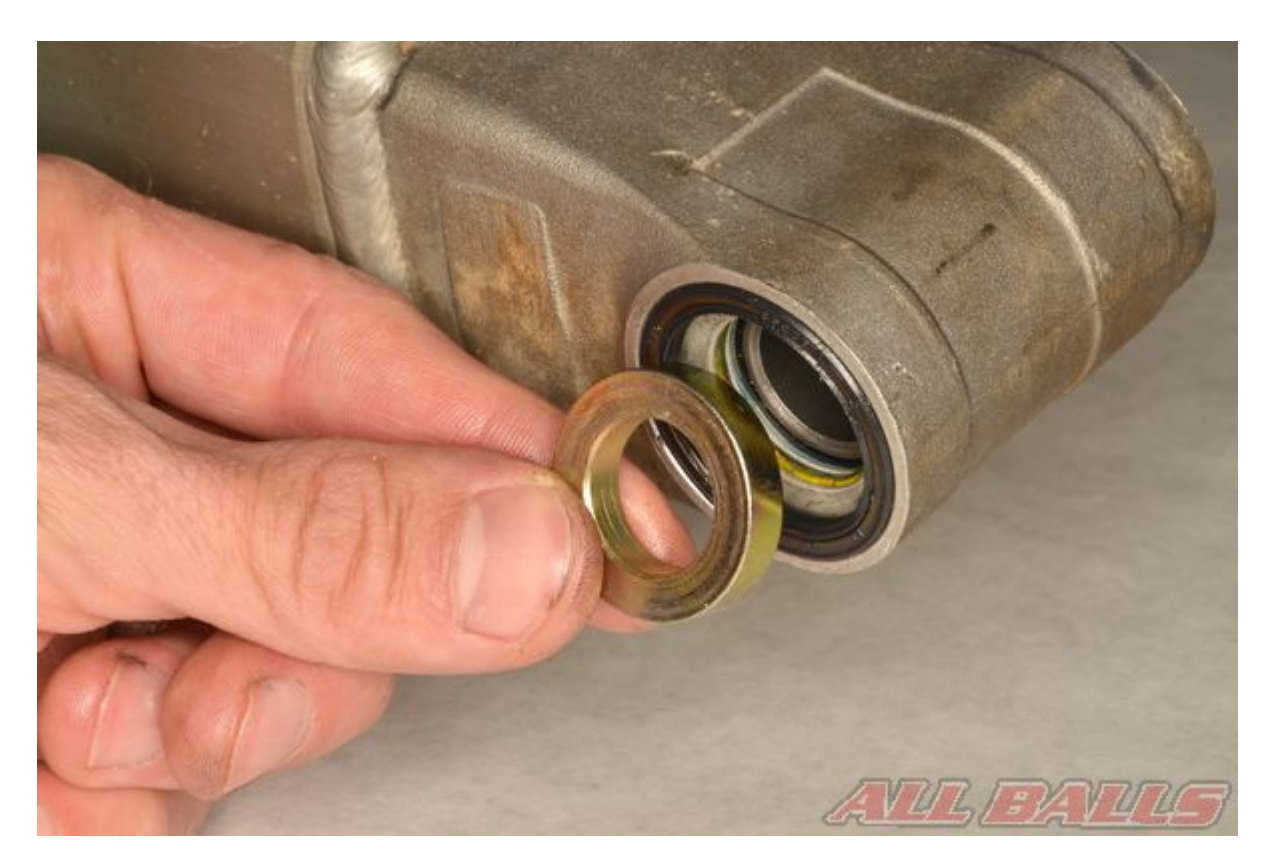
Install the side collars.