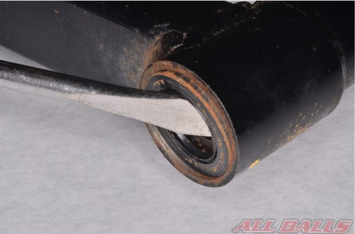
Remove the dust seals.