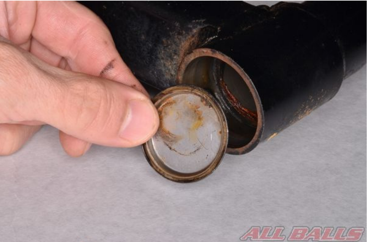
Remove the bearing grease holder.