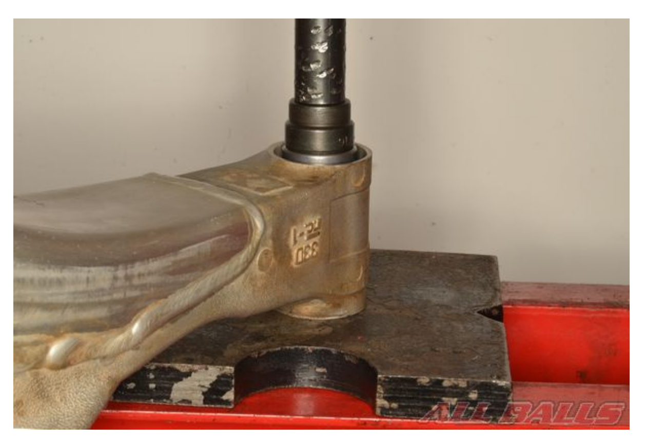
Press the bearings into the swingarm. Install the bearings rounded end first. Use a suitable driver that is slightly smaller than the outside diameter as the bearing.