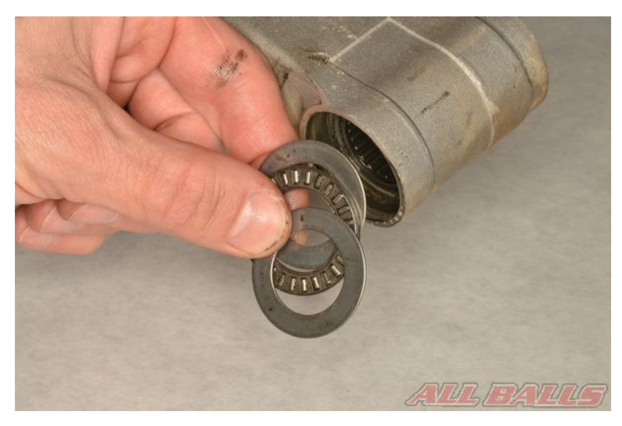
Remove the thrust washers and radial needle bearings.