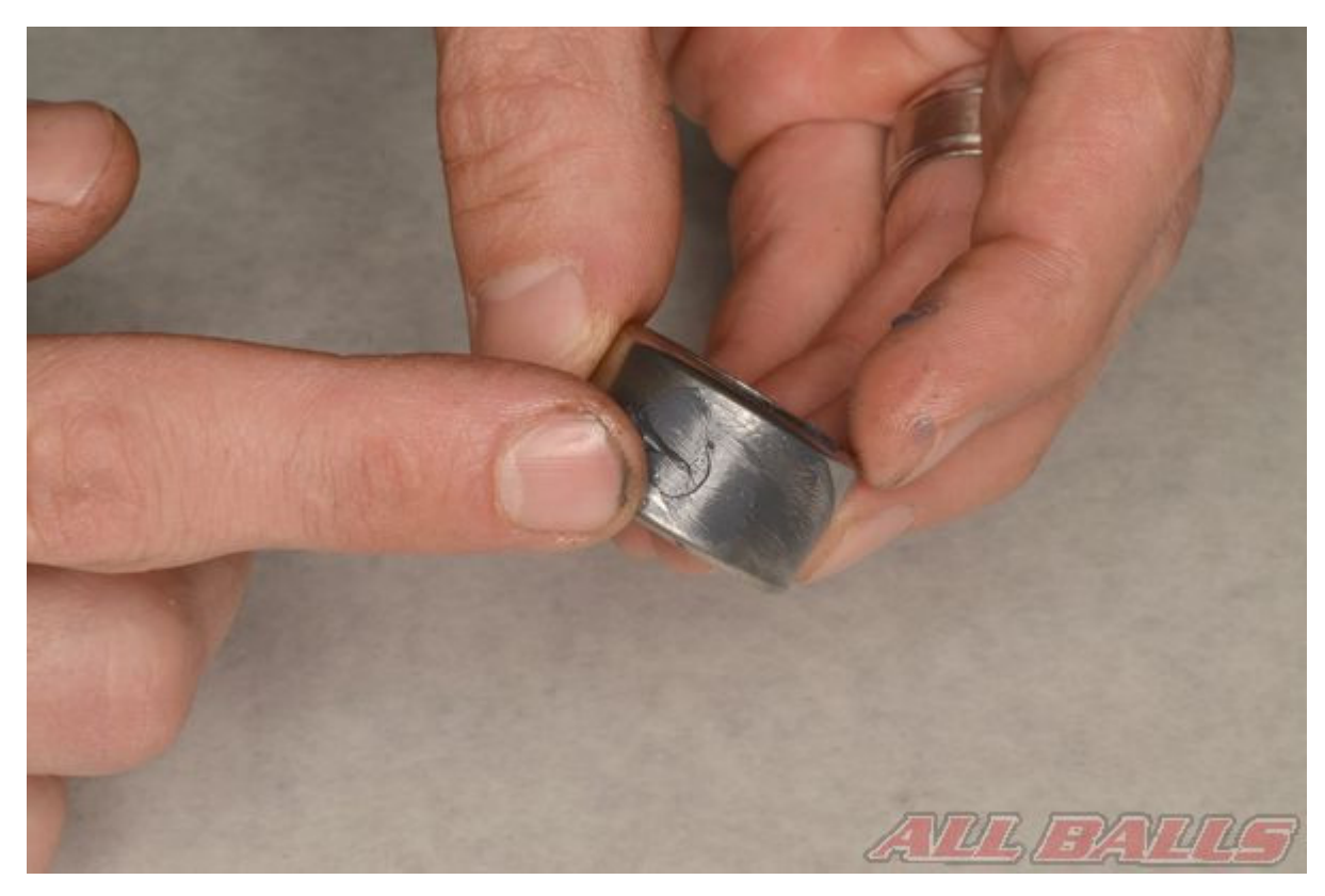
Apply a light coat of grease to the outside of the outer bearing race for smooth installation.