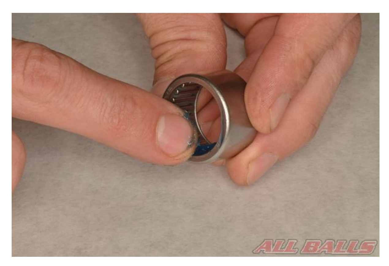
Lubricate the bearings with grease.