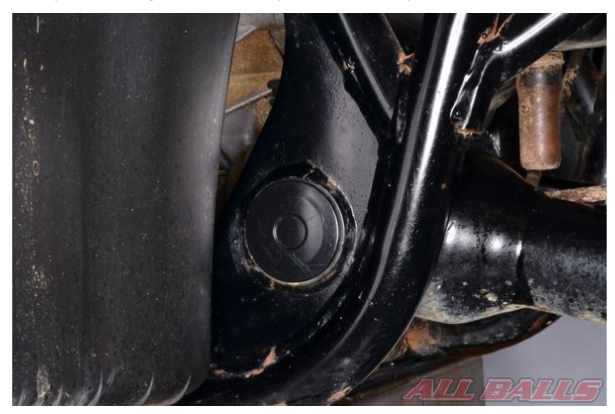
Install the swingarm pivot caps.