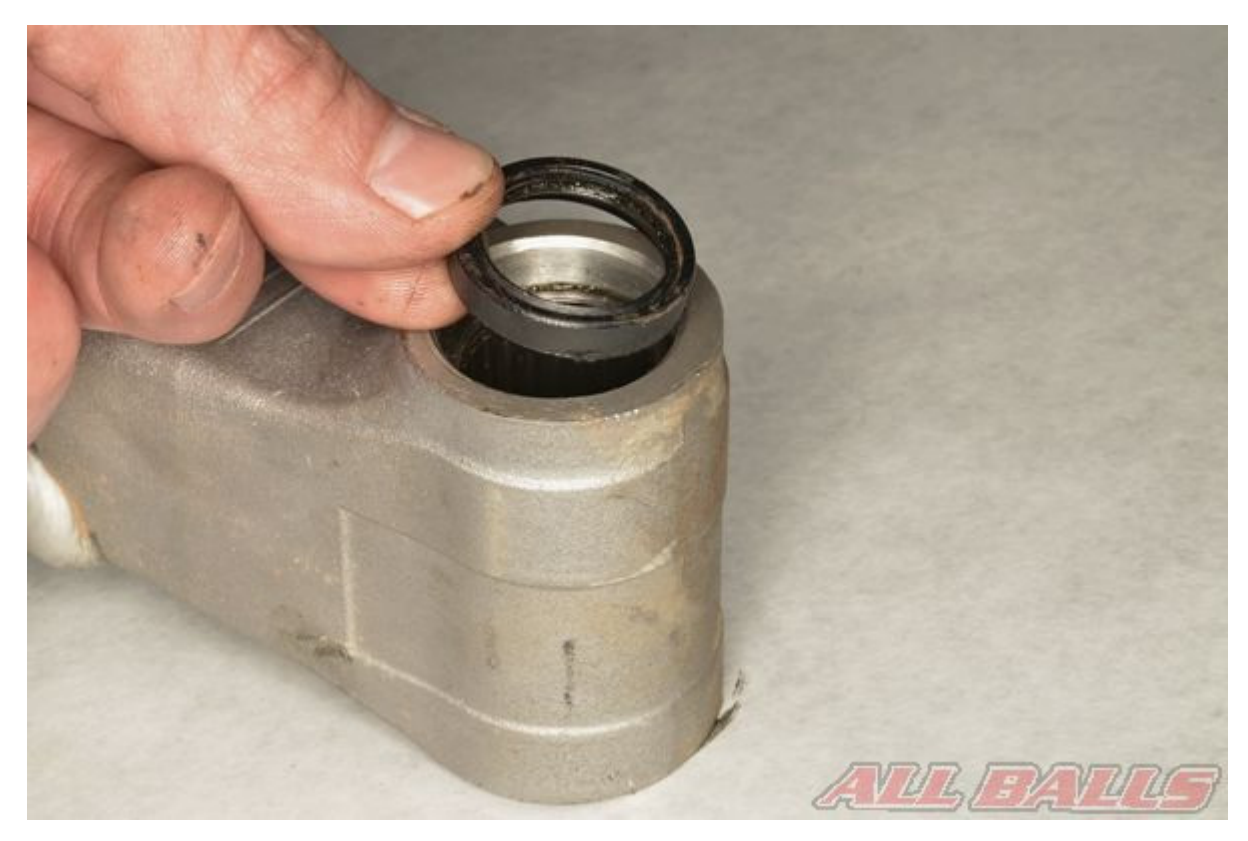
Remove the inner dust seals.