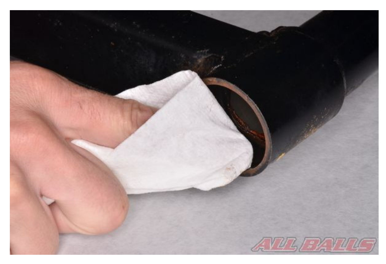
Clean away all of the old grease, grime, and rust from the bearing bores.