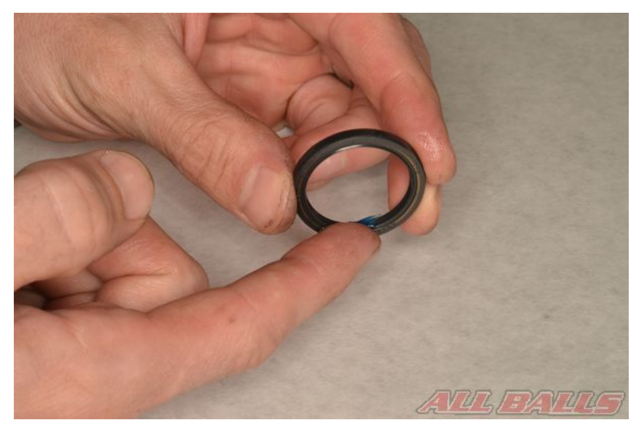
Lubricate the lips of the dust seals with grease.