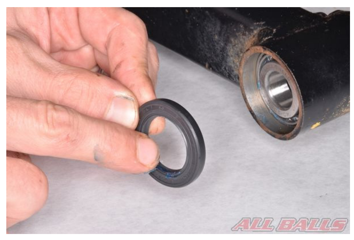
Apply grease to the lips of the dust seals.