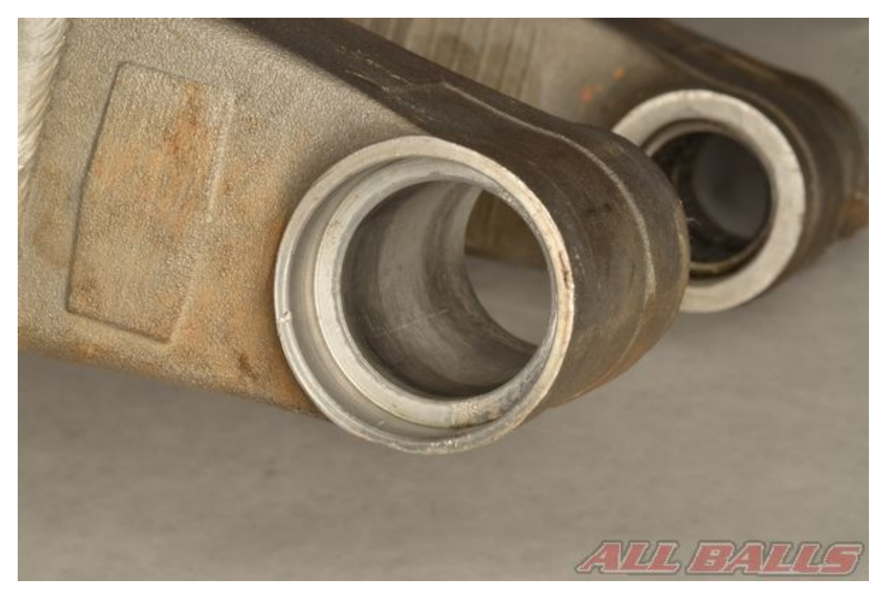
Inspect the bearing bores for wear and damage. Make sure the bores are free of damage or burrs that may cause the new bearings to hang during installation.