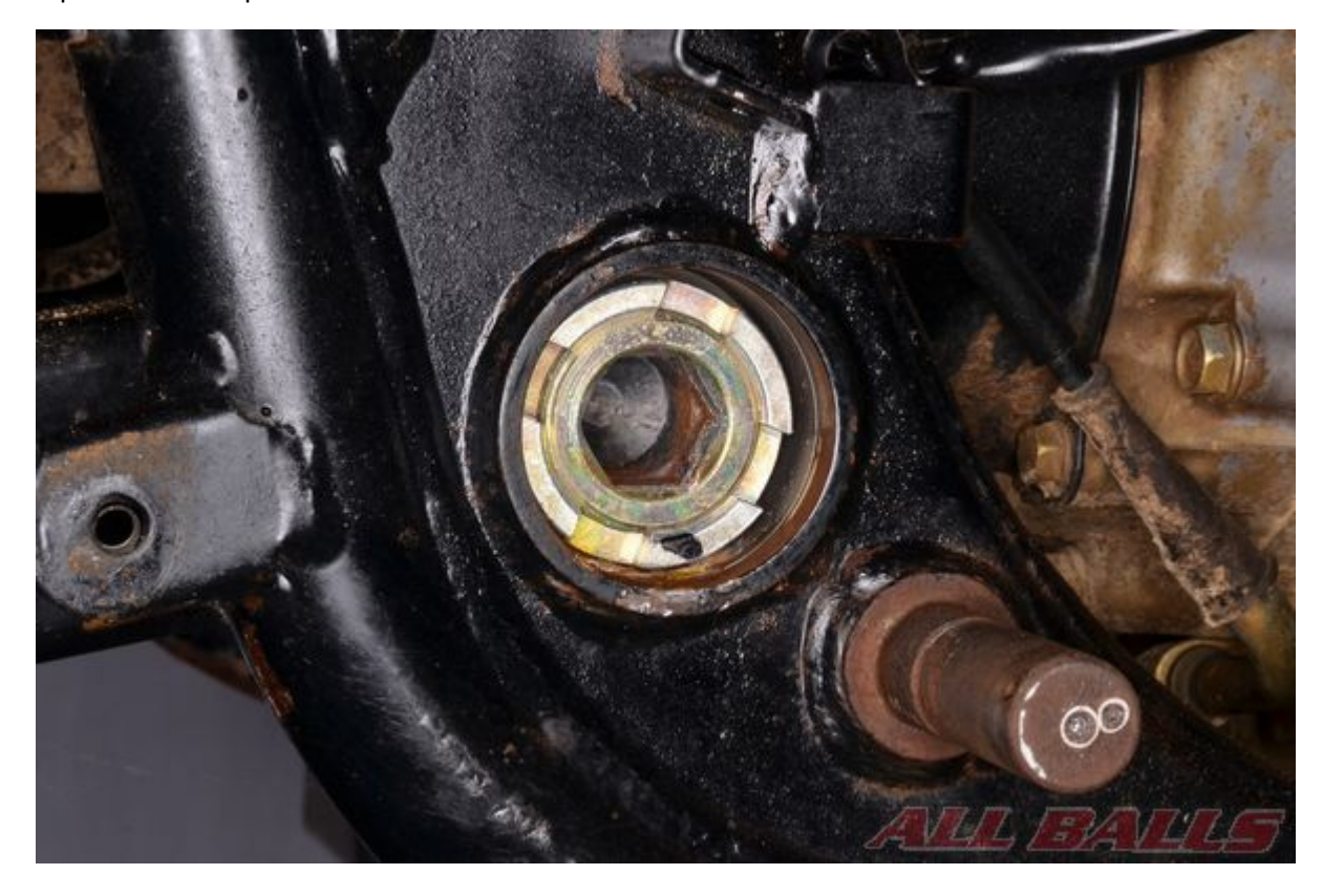
Hold the pivot bolt and tighten the locknut to specification with the special locknut wrench.

Apply a light coat of grease to the swingarm pivot bolts. Install the swingarm to the frame. Tighten the pivot bolts to specification.