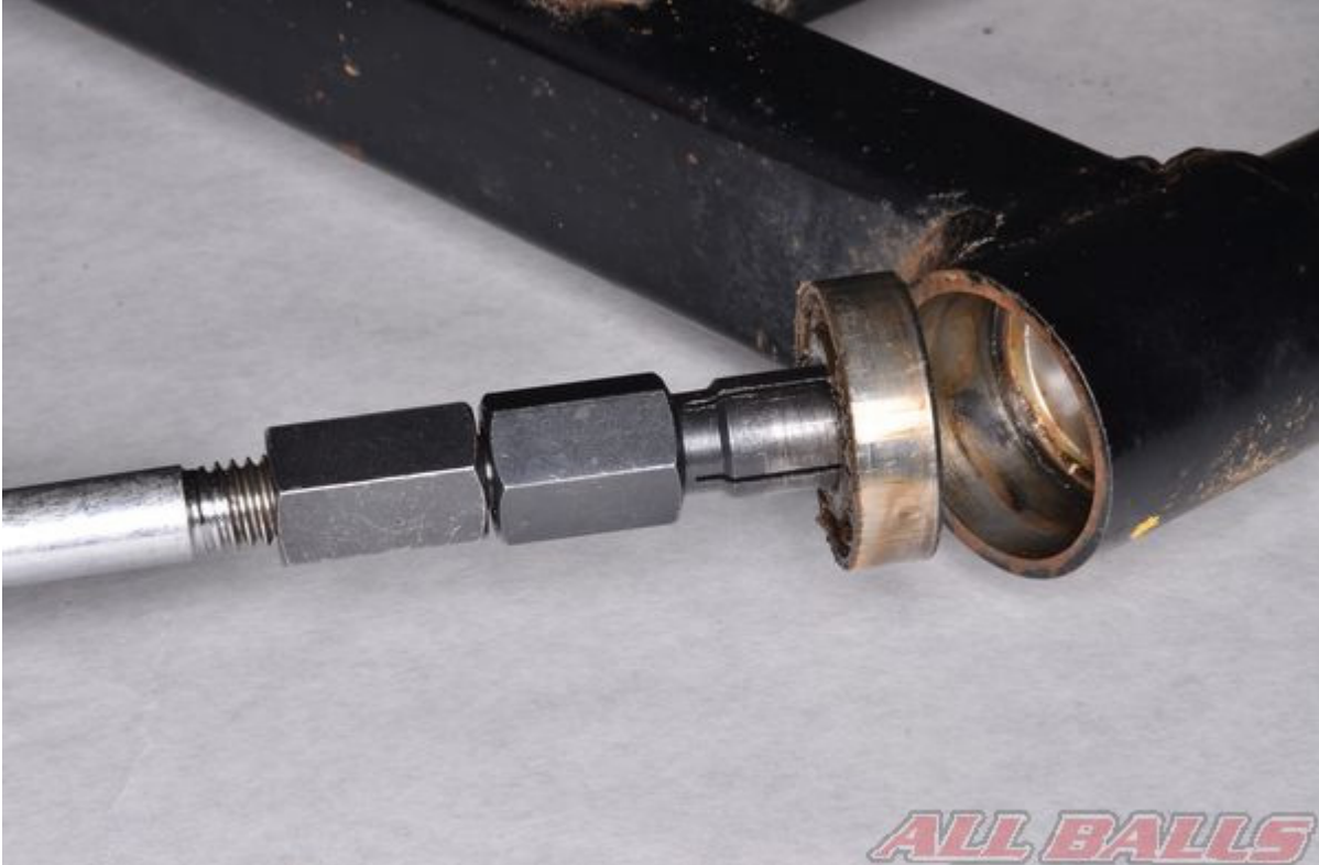
Remove the bearings with a suitable bearing puller.