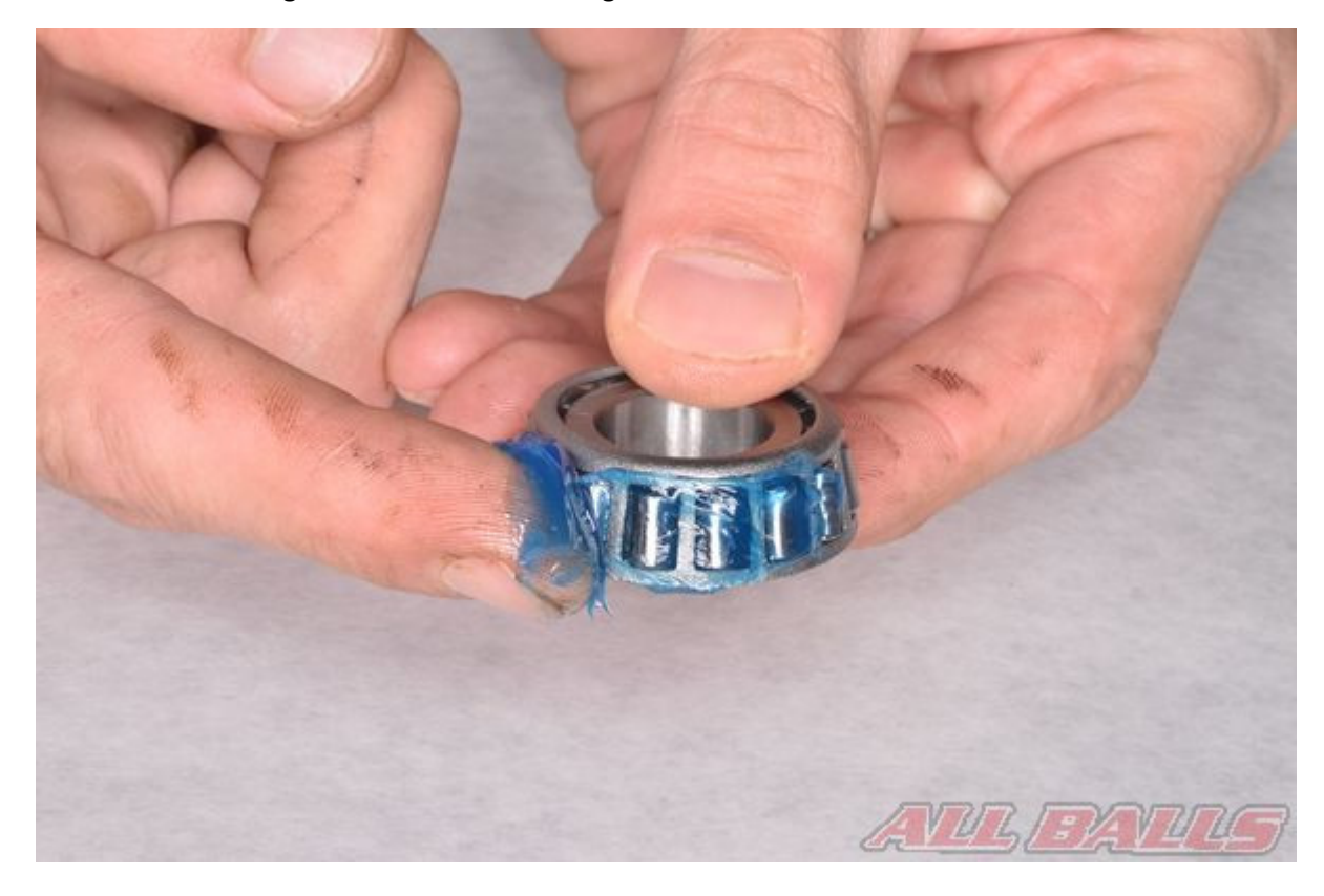
Lubricate the new bearing with grease.