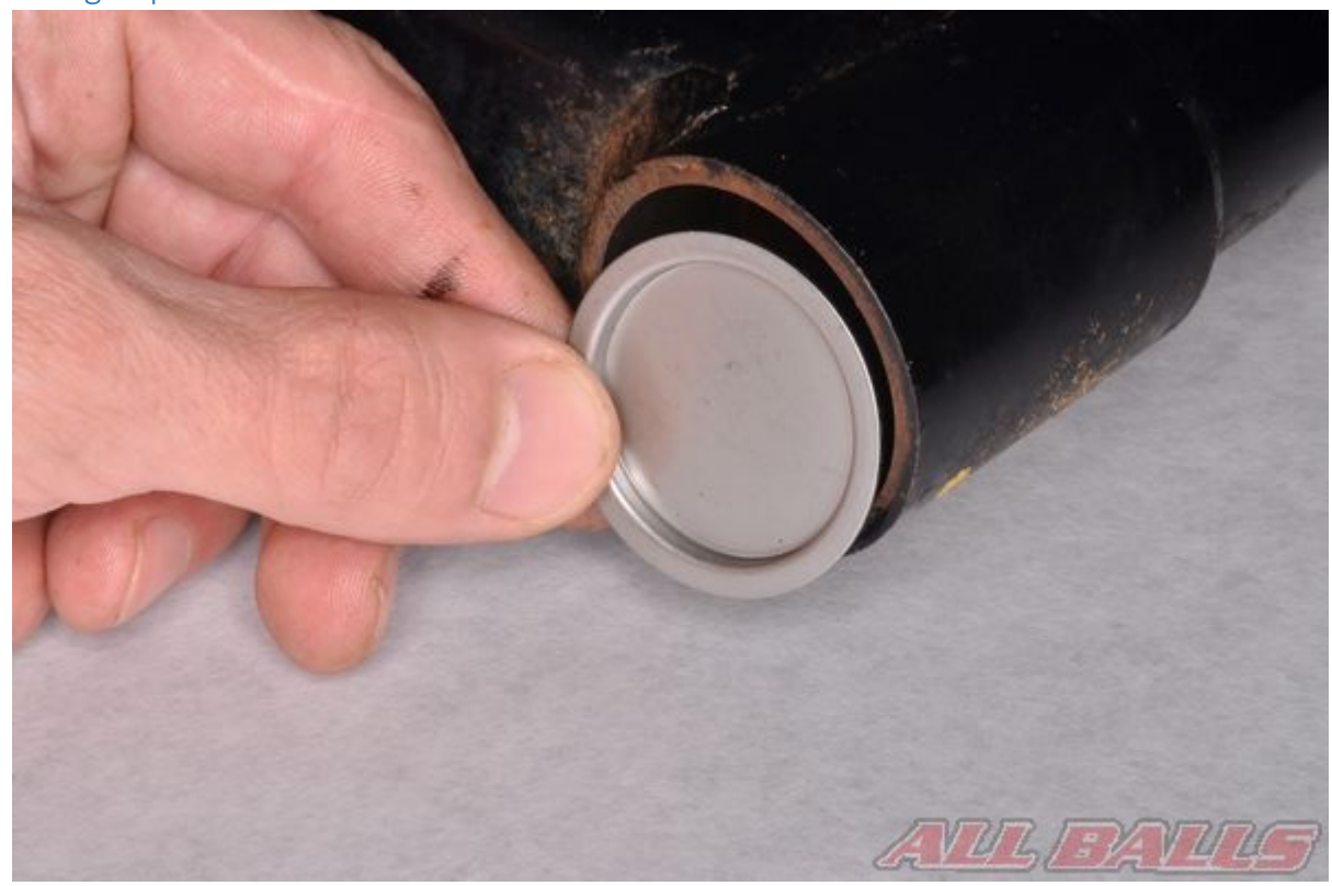
Install the bearing grease holder.