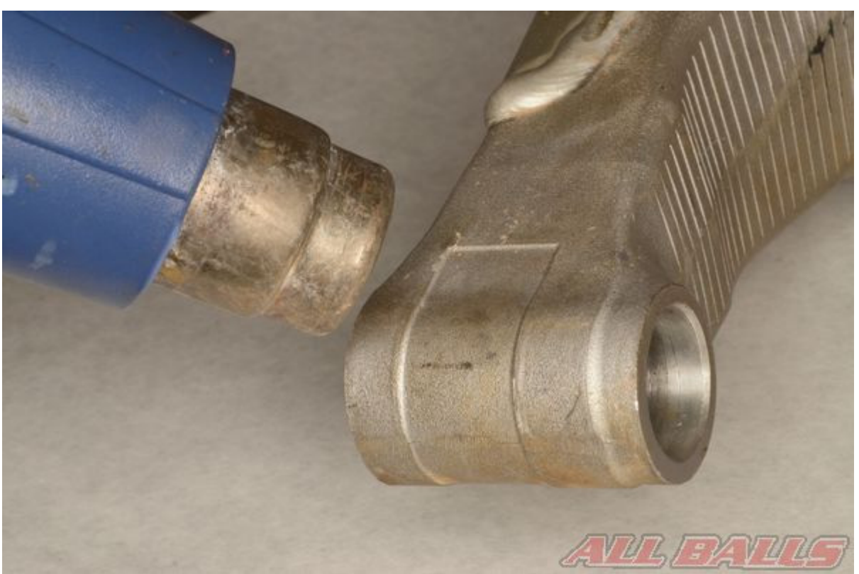
Heating the swingarm around the bearing bores will expand the metal and make removal and installation easier.