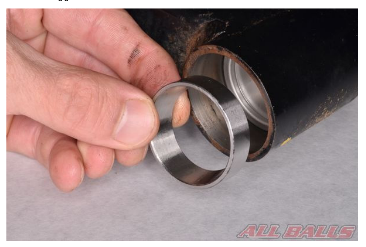
Install the bearing race.