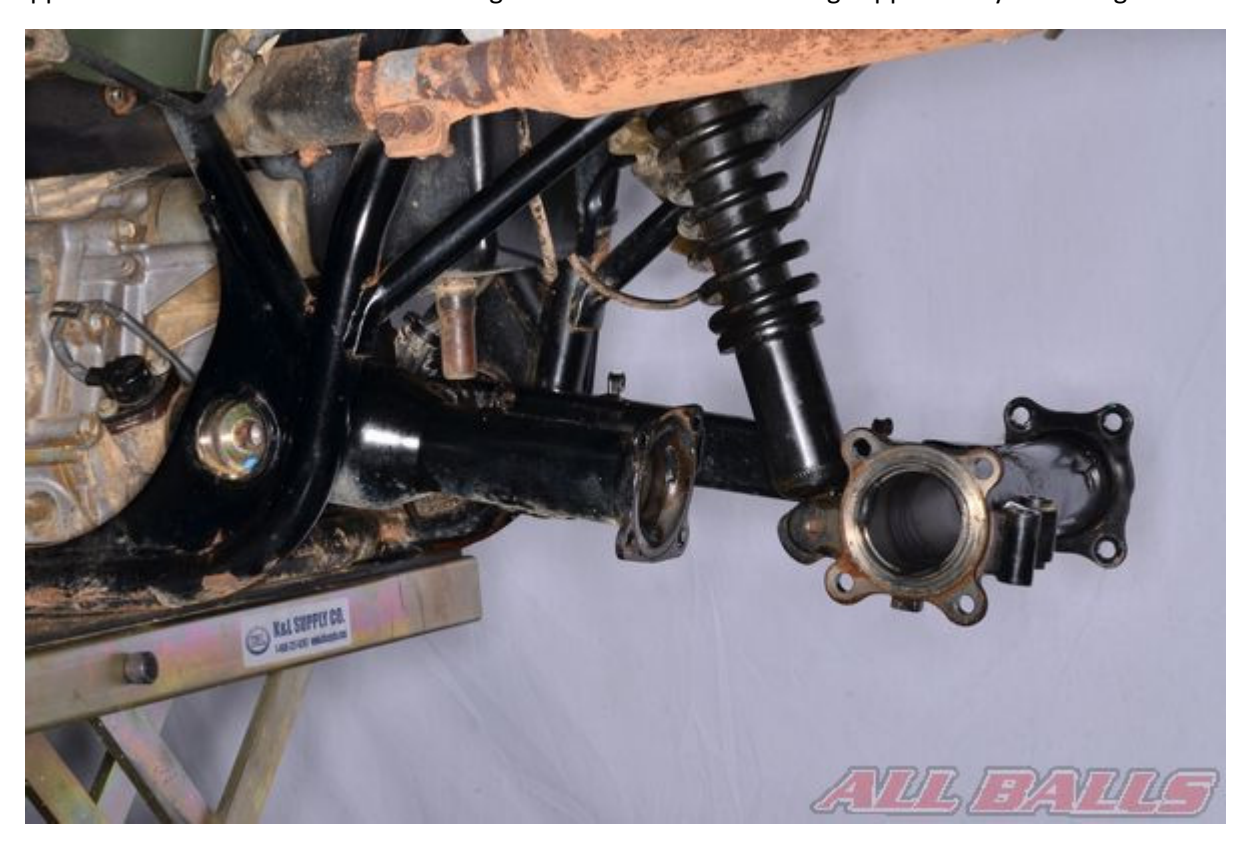
Remove the rear axle and final drive unit. Free the swingarm from the lower shock mount or linkage.