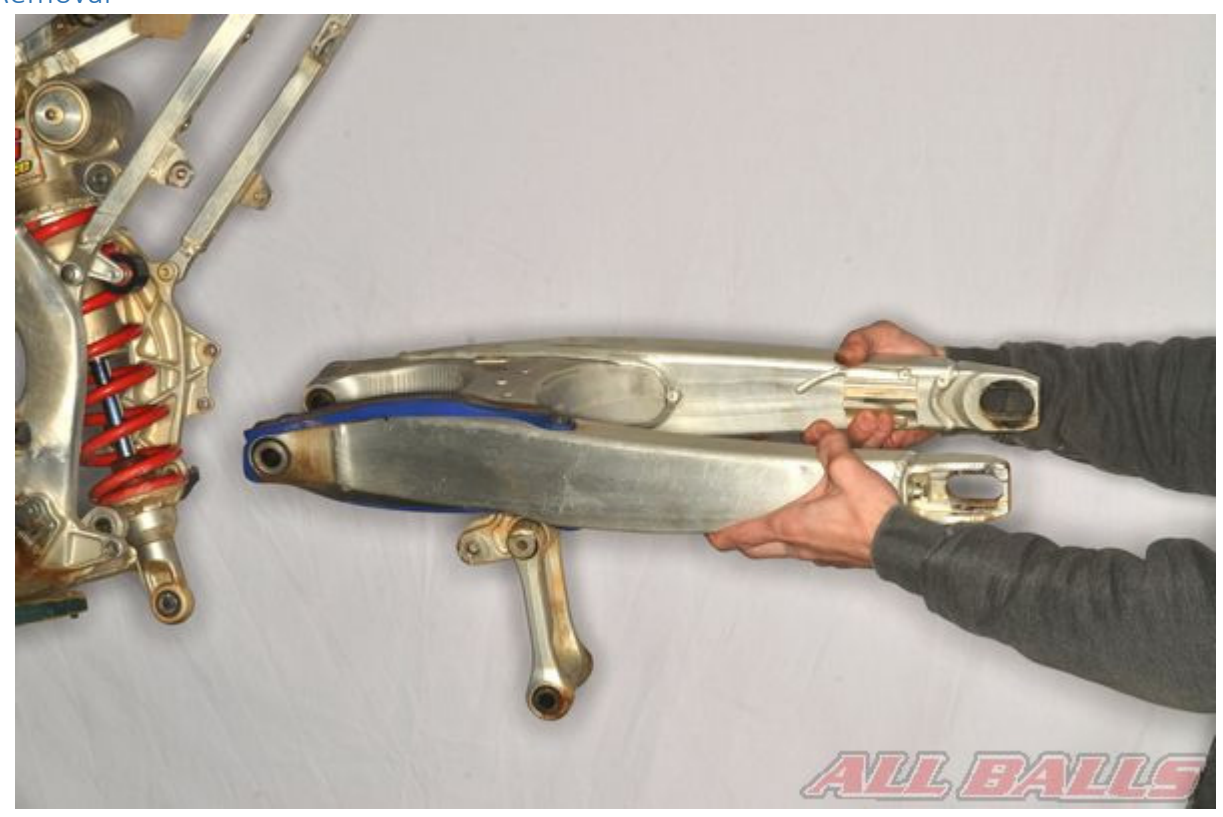
Support the back of the frame so the weight of the vehicle is not being supported by the swingarm. Free the swingarm from the frame and linkage.