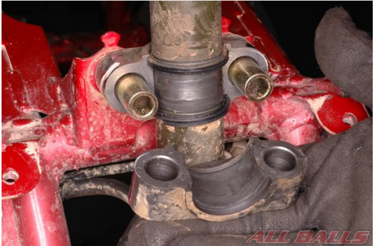
Secure the upper length of the steering stem in its bushing.