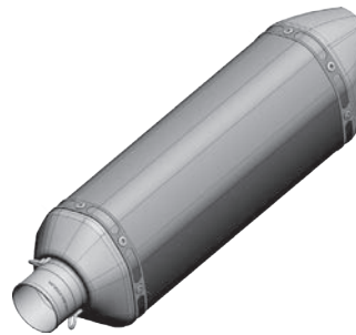
SERIAL NUMBER POSITION