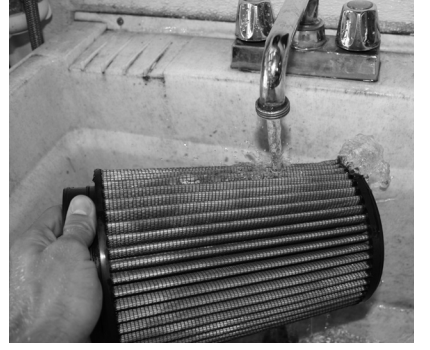
Rinse the filter with clean water to remove the dirt and excess cleaner. Continue rinsing until the water runs clear.