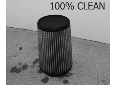
Allow the filter to dry completely (our synthetic media dries quickly and should dry within a few hours in normal conditions). Reinstall the filter in your vehicle. Do not apply oil to the filter.