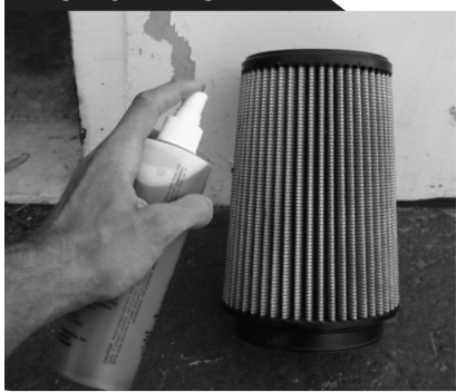
You can wash your Pro Dry S filter and return it to 100% of its original airflow. Remove the filter from the intake kit and simply spray the filter with .aFe cleaner and let sit for 10 minutes.