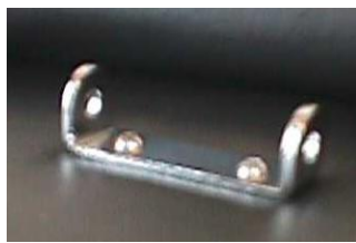
Figure 2 (U-clamp)