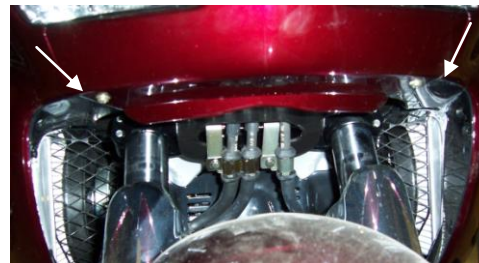
Attach adhesive pads towards rear of front fairing.