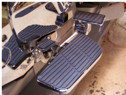
Figure 7 Completed Brake Side