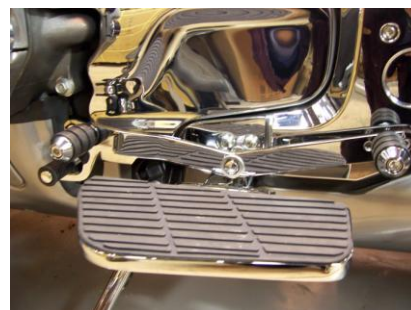
Figure 8 Completed Clutch Side