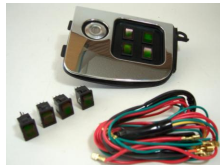
Shown lighted switches installed