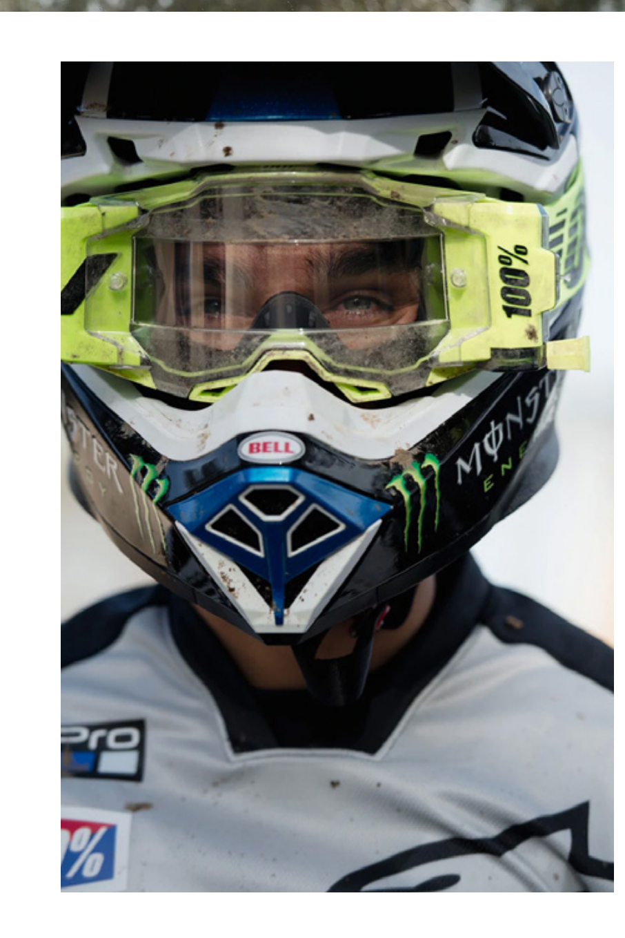
Maximize your goggle arsenal by utilizing the advanced Armega rapid-lens changing system and effortlessly swap your UltraHD lenses for a ForeCast System in a matter of seconds.