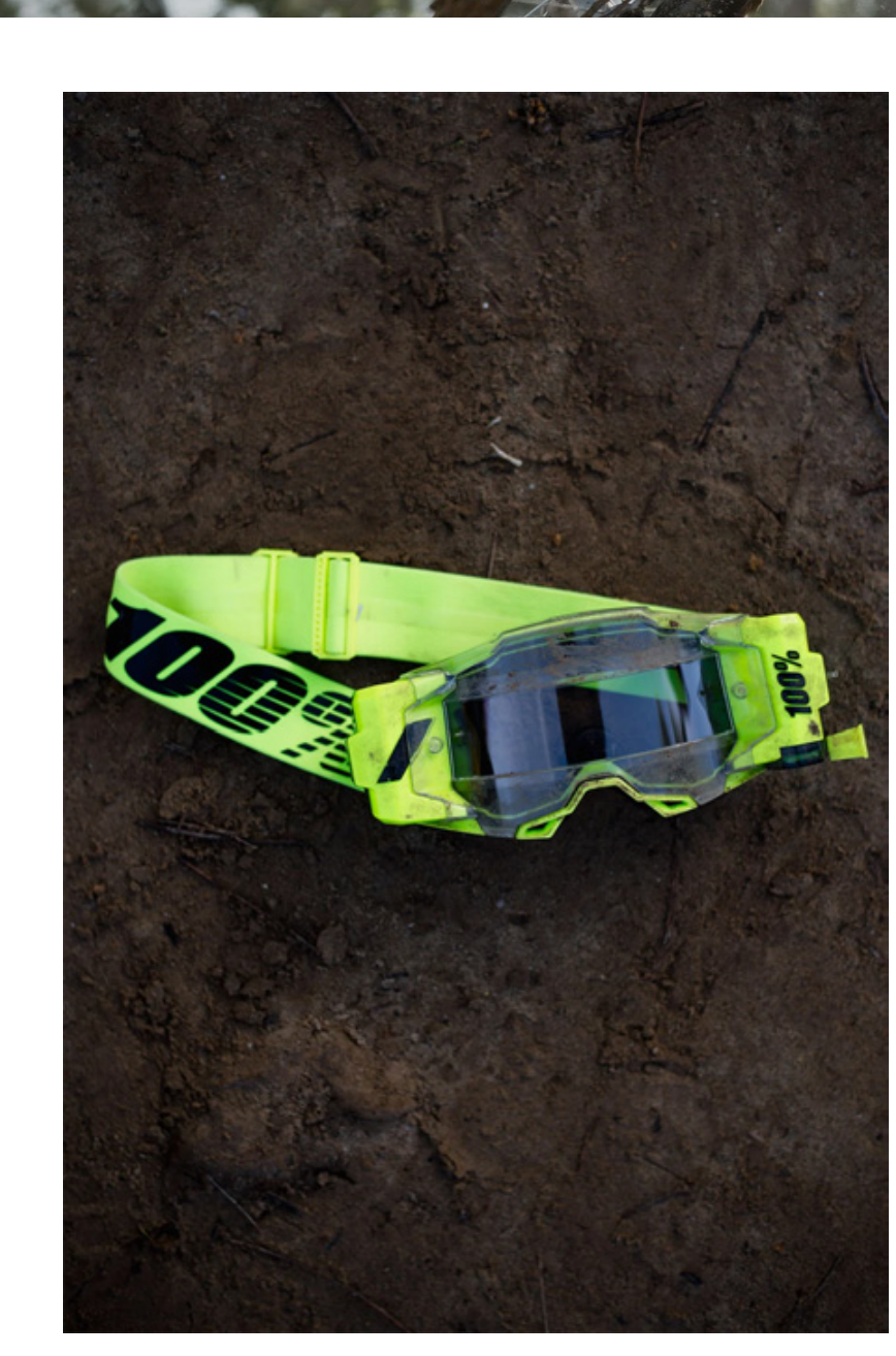
Smoother pulls, wider film, and multiple advanced systems contribute to achieving your goal by providing the maximum amount of vision.